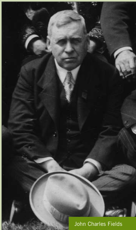
John Charles Fields