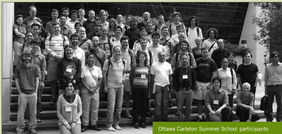
Ottawa Carleton Summer School participants